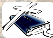
Special Bible Teachers