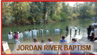
JORDAN RIVER BAPTISM